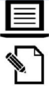
Table 1: Universal Features