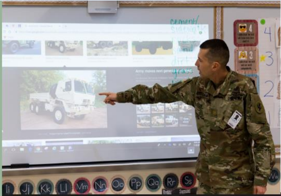
Veteran's Day Celebration 2018

Most fees are waived, courses will not be listed as deficient, and no assessments are required during the three-year term of the license.