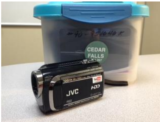
JVC Everio Camcorder